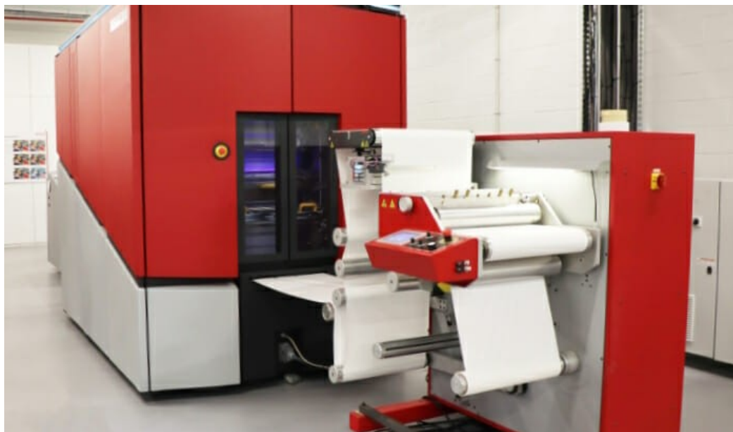
The Xeikon CX500t has an LED curing unit for crosslinking the Titon toner. (Source: pack.consult).

Dieter Finna · pack-consult.com (Click here for a German version)