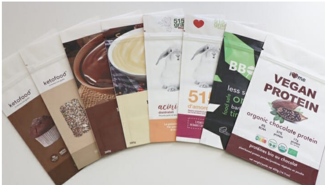
ACM digitally prints short runs of reclosable bags with Titon dry toner.

Both are criteria that are required more than ever in flexible packaging. Packaging solutions that meet these criteria cover today's requirements. In digital printing with Titon toner, it is the food-safe technology due to the absence of any liquid, low molecular weight (mobile) substances. And the barrier papers made from renewable resources stand for the sustainability of the packaging solution. In this combination, there is a broad potential for their further development in flexible packaging.