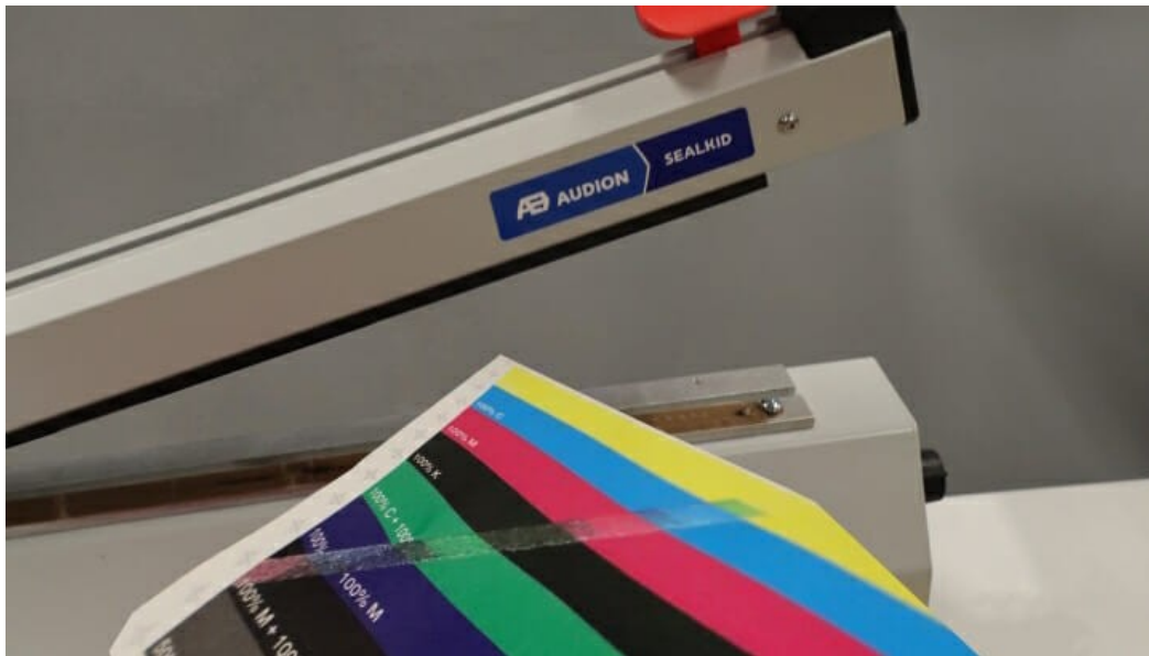
Conventional dry toner layers have insufficient seal resistance for use in flexible packaging, in contrast to Titon dry toner. (Source: pack.consult).

The seal resistance achieved in this way opens up the use of dry toner in flexible packaging. And this is where this toner process can demonstrate a general strength over other digital ink systems – its food safety properties as well as its non-melting and image quality on paper. While liquid toner, water-based inkjet or UV-inkjet have significant limitations in their compatibility with these kinds of applications, there is also a very low risk of food migration due to the specific composition of Titon toners based on the very high molecular weights of the ingredients used.