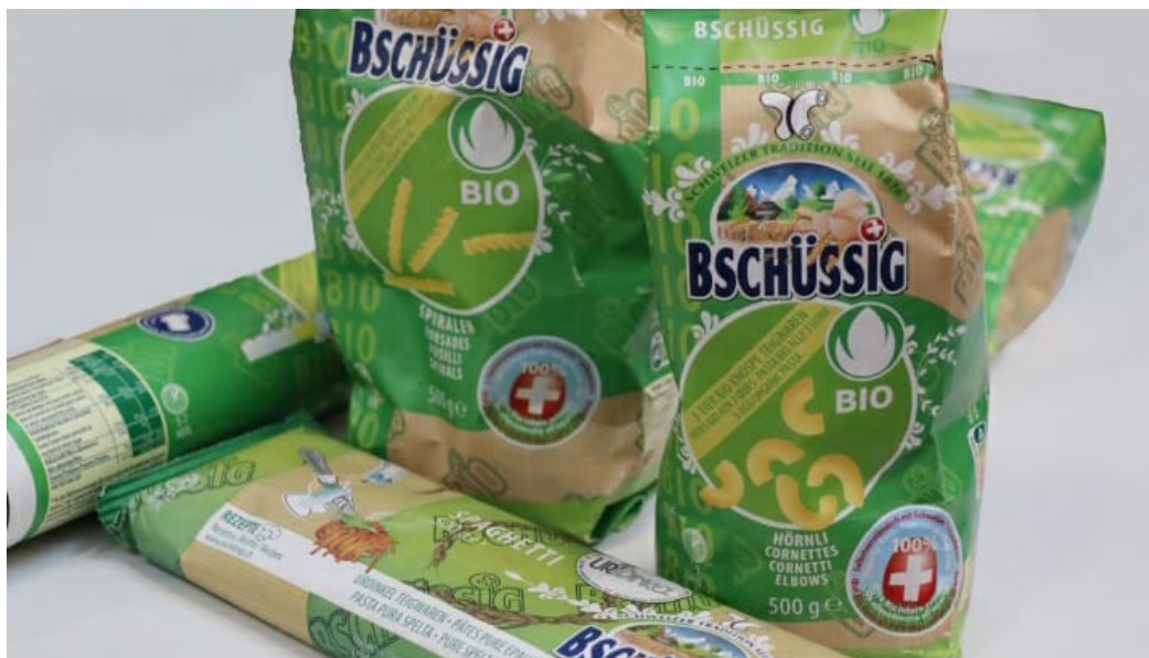
In the green packaging line from the Swiss manufacturer Bschüssig, the noodles are packed in barrier paper printed with Titon Toner Technology.

With the increasing use of barrier papers in flexible packaging, the possible applications of digitally printed packaging with dry toner are also growing. The pasta manufacturer Bschüssig in Frauenfeld was the first manufacturer in Switzerland to switch its 33 different pasta packages to barrier paper. For their recently added green packaging line, they preferred digital printing as it was ideal for the initial production at launch. The packaging was printed with Titon toner on kraft paper, without overprint varnish. The fact that the packaging in this design cannot be stored in a damp environment is not an issue for Bschüssig customers. In return, they can dispose of the packaging through the normal waste paper stream after use.